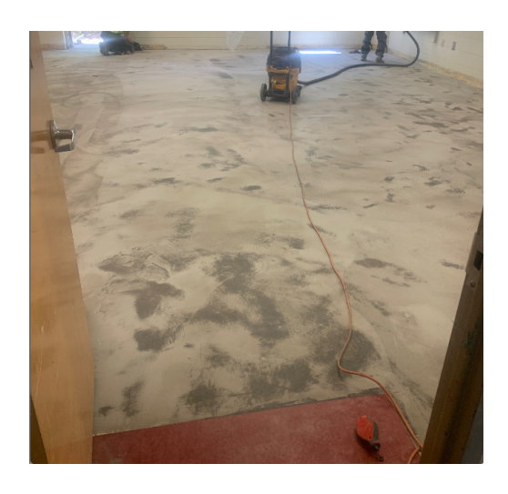
Started floor prep and working on install of VCT of the 1st floor classrooms.