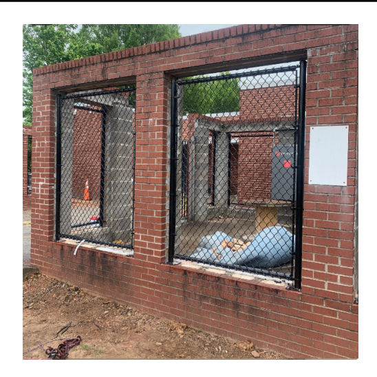
Installed fencing for generator enclosure.