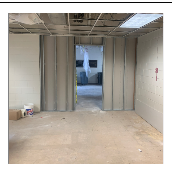
Temporary wall has been framed up in the main entrance/ administration area.