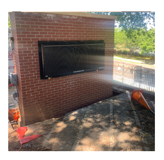
Installed LED at the Monument sign.