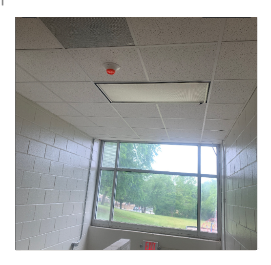
Install ceiling tile at stairwell on the 3rd and 2nd floor.